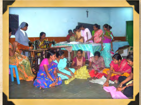
These 14 women have to share two sewing machines!

A sewing machine costs only $100! When you buy a sewing machine for this group, you are saving lives. These women want the dignity of work, so they can help support their families.