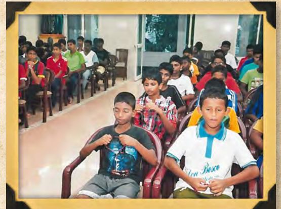
Children from St. Bede's orphanage praying the rosary on their donated rosaries.