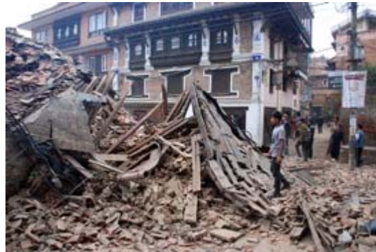
Damage in Swatha Square in Kathmandu.

Our Church mourns the terrible suffering of our brothers and sisters affected by this powerful earthquake. The earthquake struck the Kathmandu valley, which is densely populated with nearly 2.5 million people. Tens of thousands of families are sleeping outside in Kathmandu and require shelter and protection from the cold and relentless rain, which has worsened conditions. Aftershocks continue—one reaching 6.7 magnitude and another 5.4 magnitude—increasing fear, causing further damage to buildings, and interrupting rescue operations. Most markets in Kathmandu are closed. People urgently need basic essentials. Shelter, blankets, safe water, food, medical care, hygiene and counseling are priorities. Hygiene and sanitation are critical to preventing waterborne diseases.